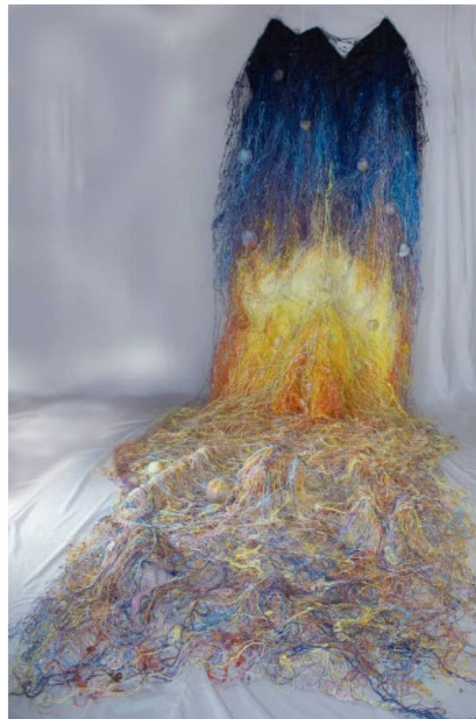
Title: Flow Medium: Thread and Acrylic Size: 60 by 94 inches Year: 2023