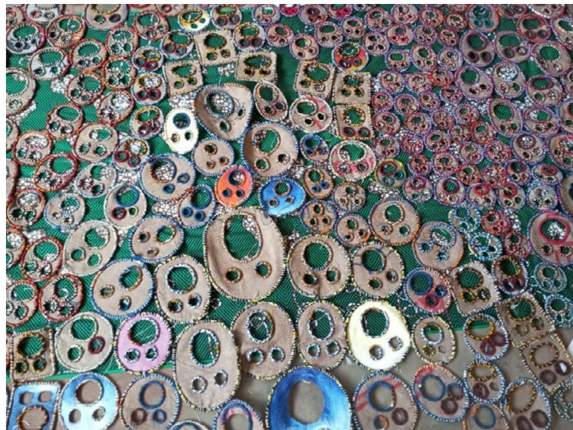
Title: Talku Talku, Plenty Voices, Silence Everywhere Medium: Size: 230 by 150 cm Year: 2023