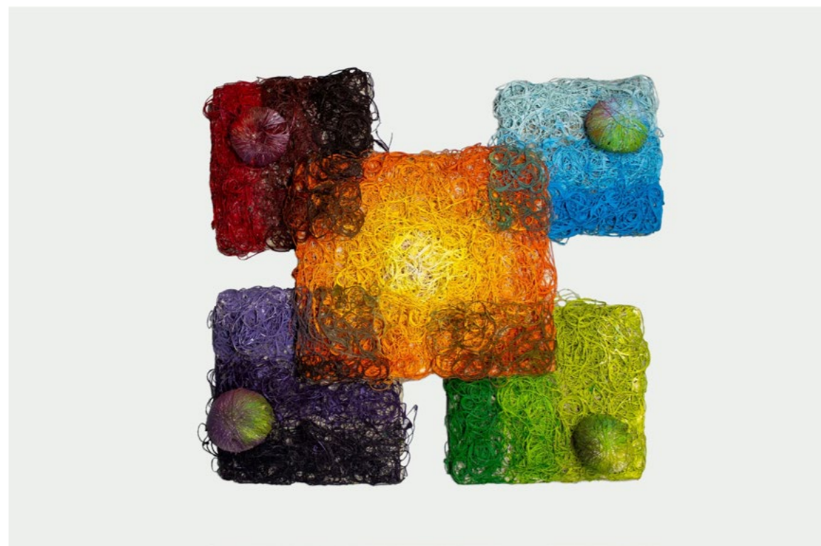
Title: Igwebuiké Medium: Threads and Acrylic Size: 24 by 22 inches Year: 2023