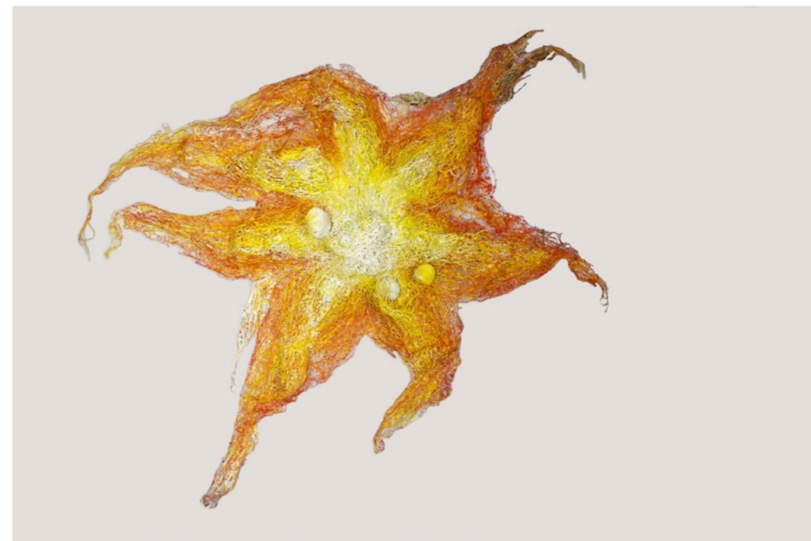
Title: Exuberance Medium: Threads and Acrylic Size: 24 by 88 inches Year: 2023