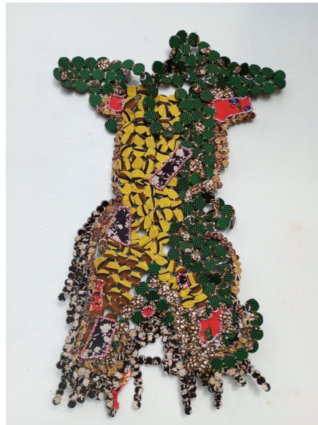
Title: Plenty Patches on My mother's Gown Medium: Size: 114 by 75 cm Year: 2023