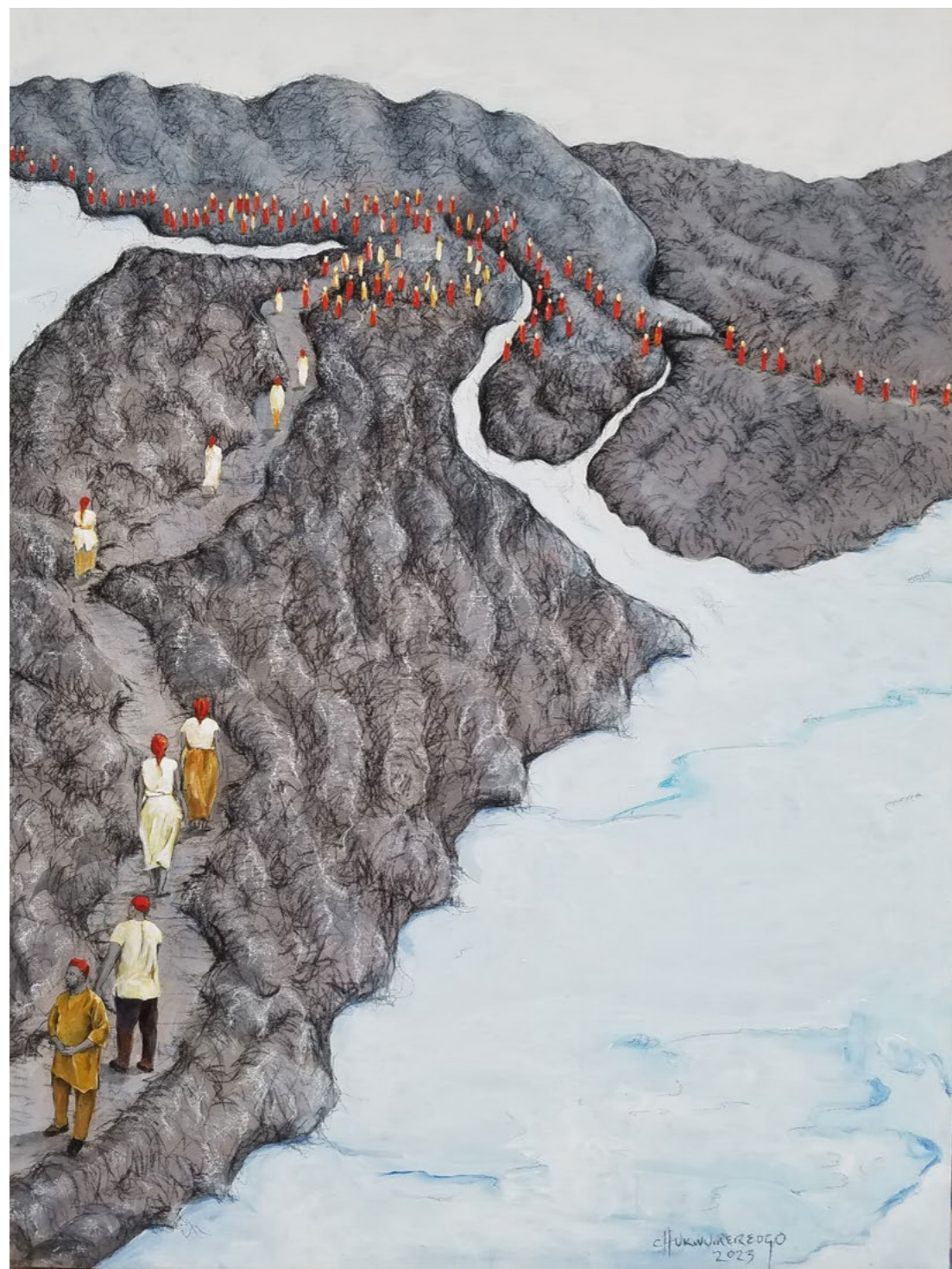
Title: Time will Reveal II Medium: Acrylic, Charcoal and pastel on canvas Size: (ft) 4 by 3 Year: 2023