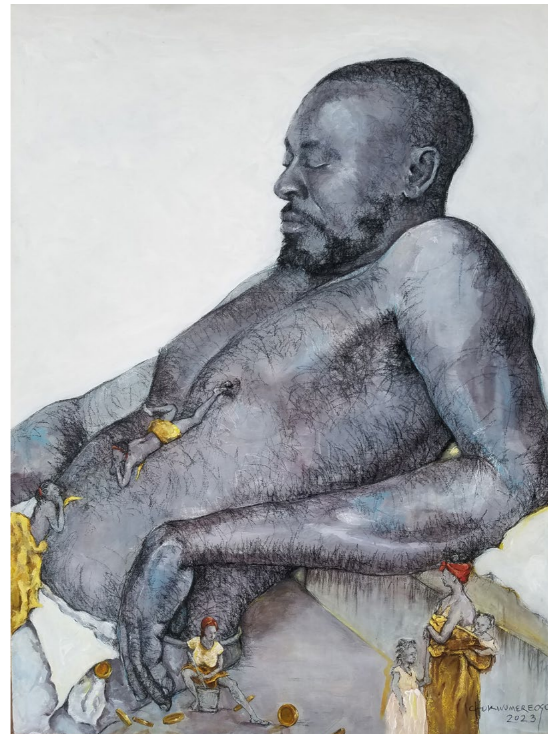
Title: Man and Materials Medium: Acrylic, Charcoal and Pastel on canvas Size: (ft) 4 by 3 Year: 2023