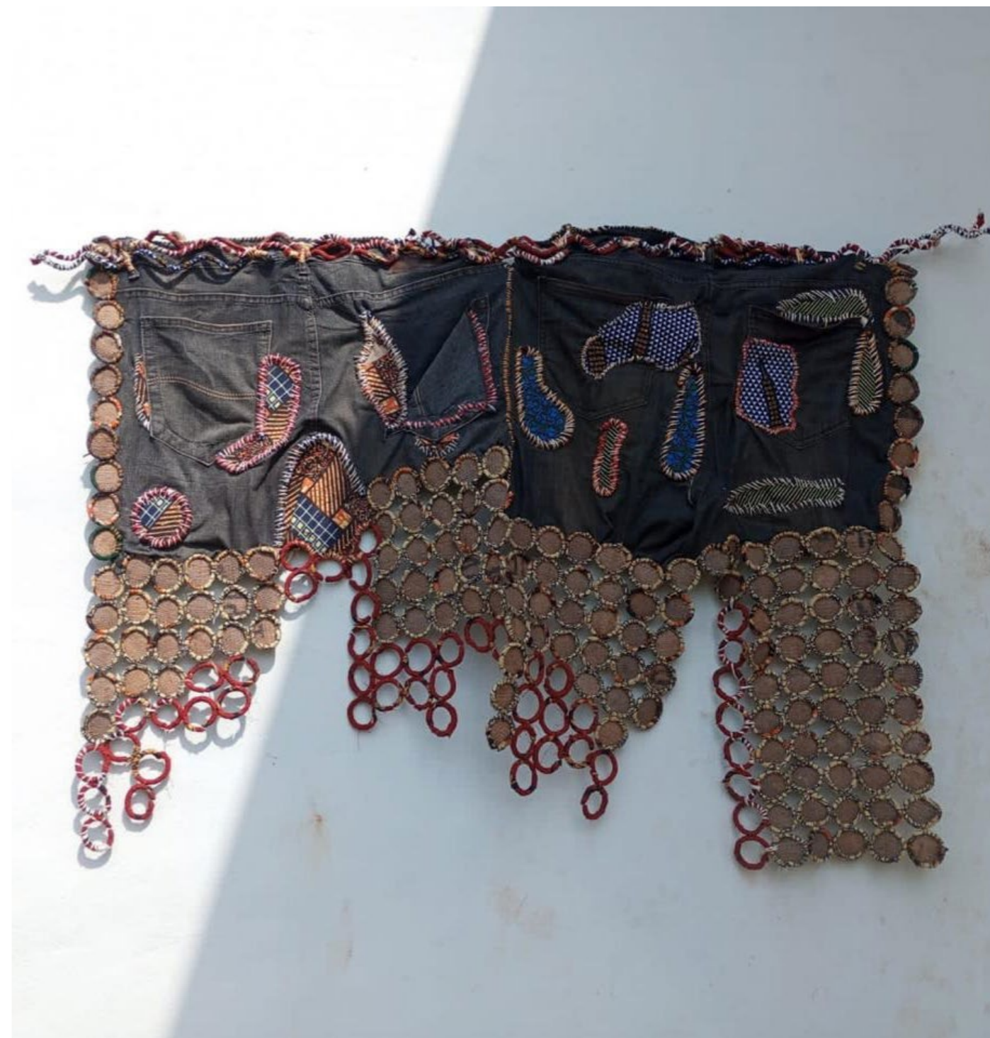
Title: Labourer's Short Nicker Medium: Size: 108 by 78 cm Year: 2023