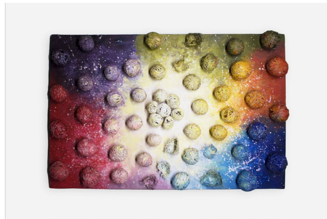
Title: Ripples and Spirals Medium: Thread and Acrylic on canvas Size: 36 by 24 inches Year: 2022