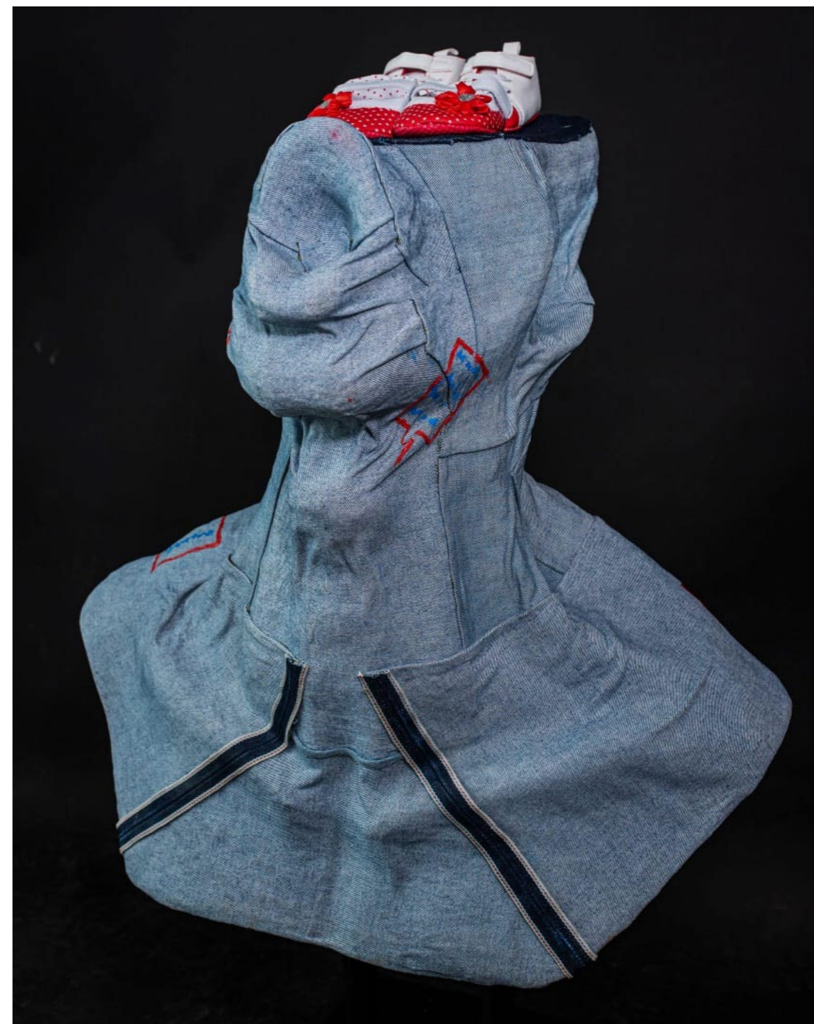
Title: When Medium: Denim(Jeans) Size: 65 by 69 cm Year: 2023