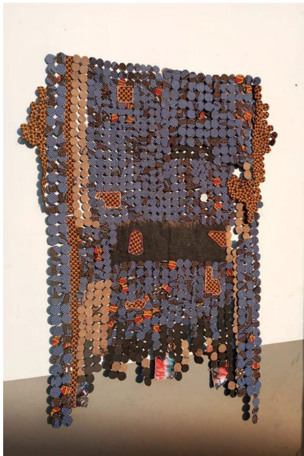
Title: Plenty Patches and spots on my Beautiful Cloth Medium: Size: 150 by 96 cm Year: 2023