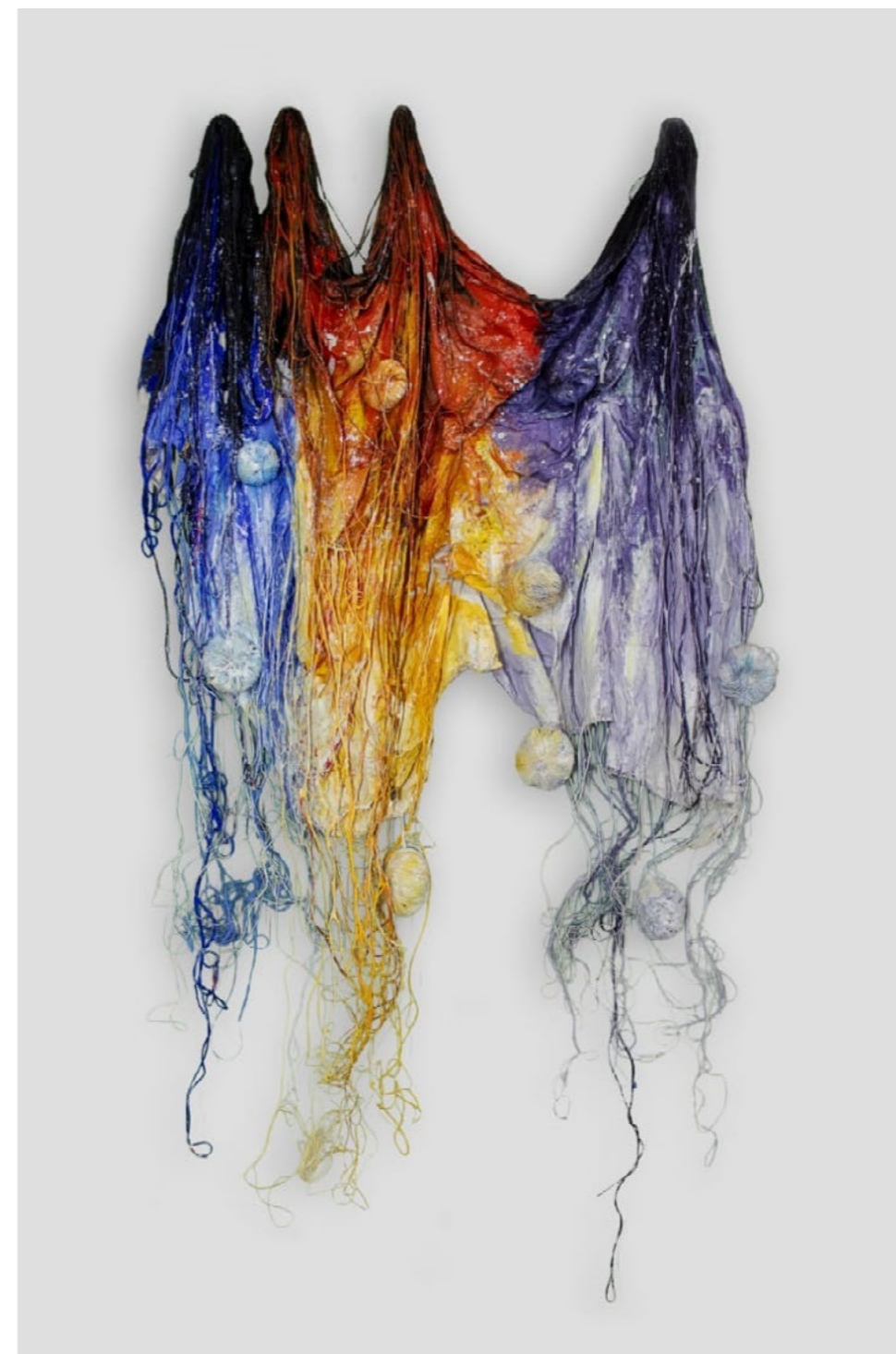
Title: Essence Medium: Thread and Acrylic on cotton Size: 31 by 63 inches Year: 2023