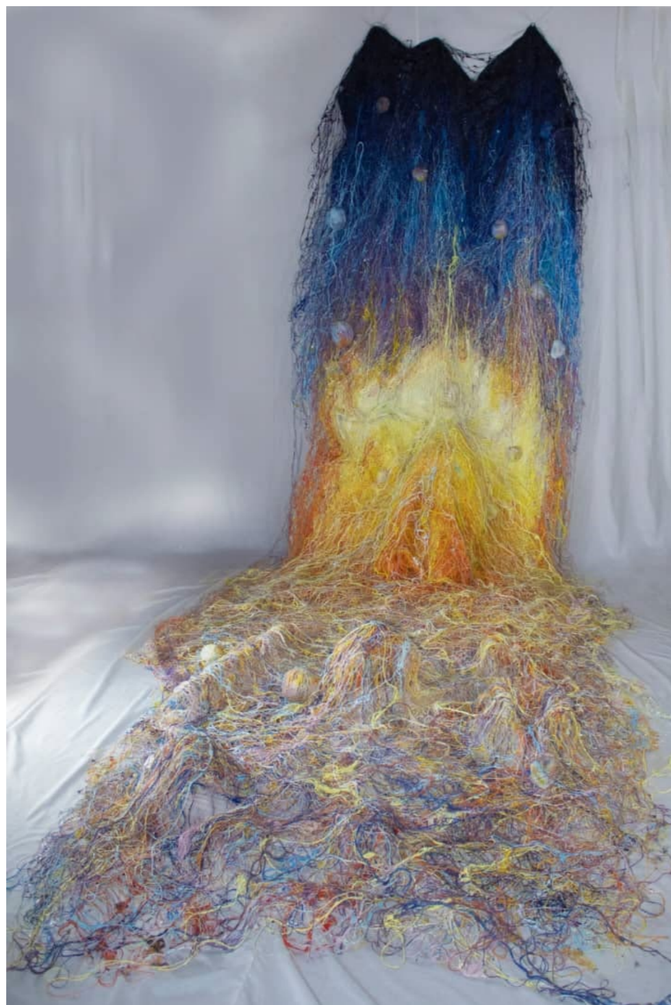
Title: Flow Medium: Thread and Acrylic Size: 60 by 94 inches Year: 2023