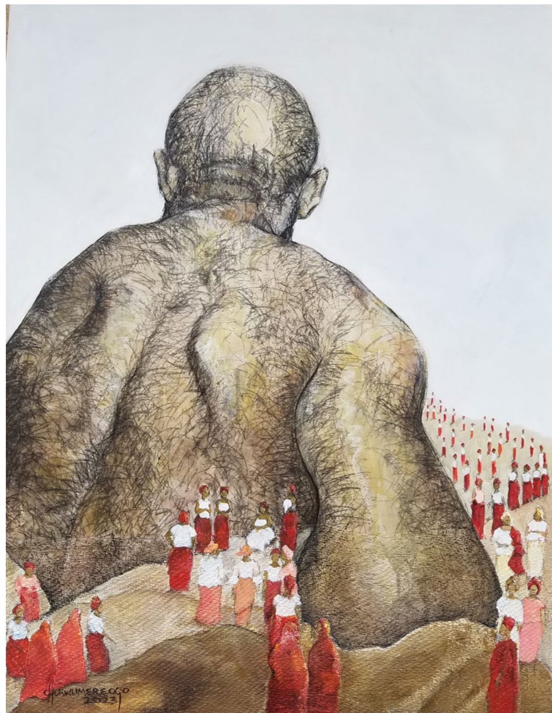
Title: The Meeting of the 54 Medium: Acrylic, charcoal and pastel on canvas Size: (ft) 4 by 3