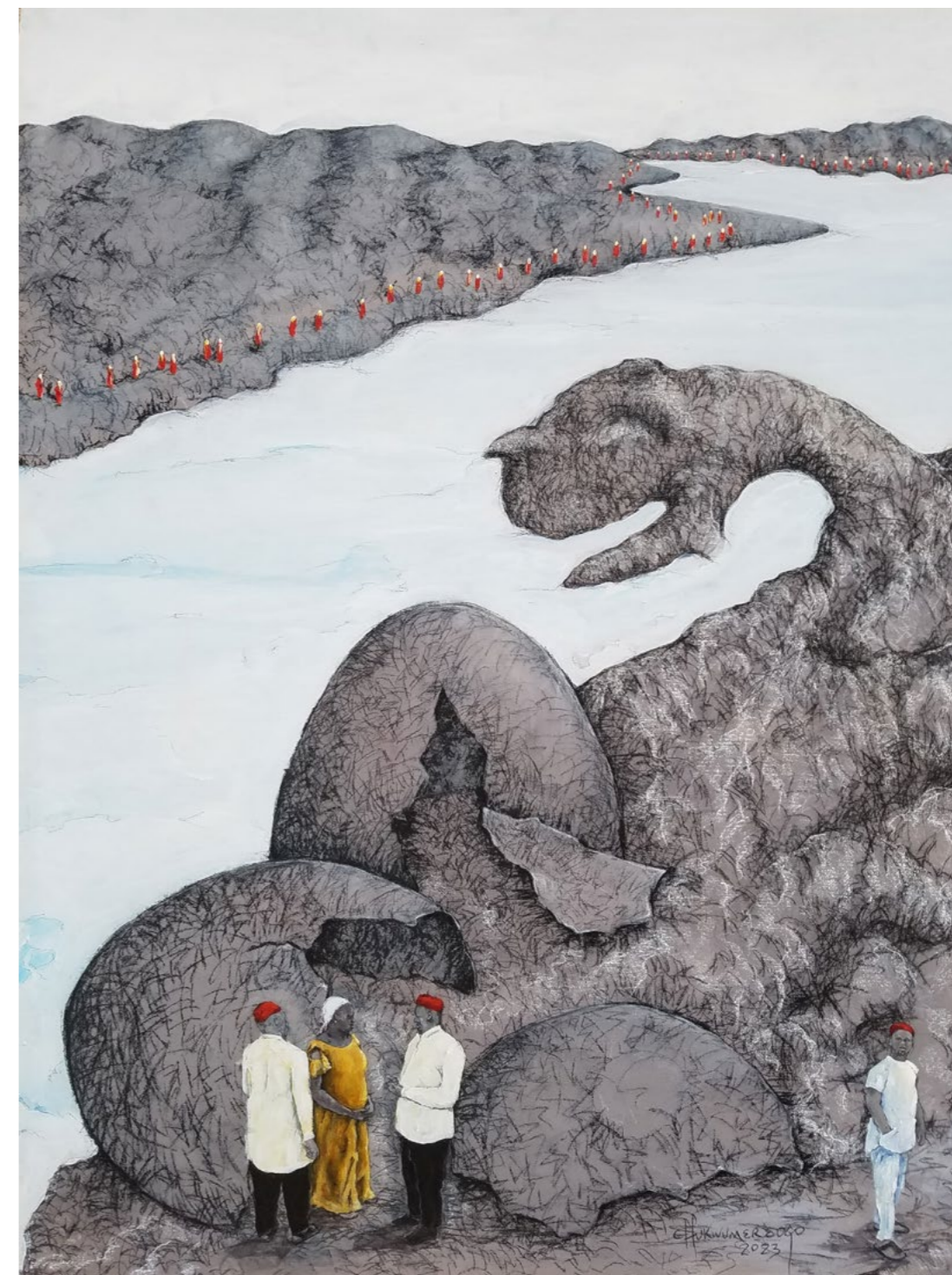
Title: Time will Reveal Medium: Acrylic, charcoal and pastel on canvas Size: (ft) 4 by 3 Year: 2023